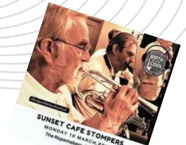
SUNSET CAFE STOMPERS MONDAY 16 MARCH, 8PM The Ropemakers, Bridport FREE