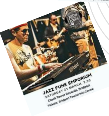
JAZZ FUNK EMPORIUM SATURDAY 21 MARCH, 7.30pm Clock Tower Records, Bridport Tickets: Bridport Tourist Info Centre