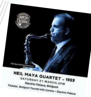
NEIL MAYA QUARTET - 1959 SATURDAY 21 MARCH, 3PM Electric Palace, Bridport Tickets: Bridport Tourist Info Centre • Electric Palace