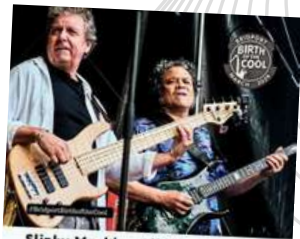
Slinky Machine All Stars THURSDAY 5 MARCH, 7.30pm Clock Tower Records, Bridport Tickets: Bridport Tourist Info Centre